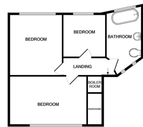
1ST FLOOR APPROX. FLOOR AREA 548 SQ.FT. (55.9 SQ.M.) TOTAL APPROX. FLOOR AREA 1137 SQ.FT. (105.7 SQ.M.) The plan is not drawn to scale and is for illustrative purposes only. Made with Maptive 10022